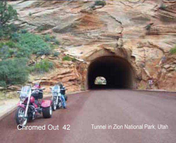
Chromed Out 42

As we rode we knew that God had us just where He wanted us to be, safe in His loving arms! Our trip gave us a renewed appreciation for the blessed America that God has bestowed upon each of us. He allowed us to experience so many wonderful places and people beyond our wildest dreams. He brought us so many different challenges and so many associated solutions that we are simply in awe of His love and power. Along this trip we developed a greater appreciation for: God and His creations; this country of freedoms and the many people who have fought, sacrificed and paid the price for our freedoms; the explorers and pioneers who braved the unknown to discover a new world; the brave people that developed the infrastructure we take for granted; and the friends and family that took a virtual journey with us.