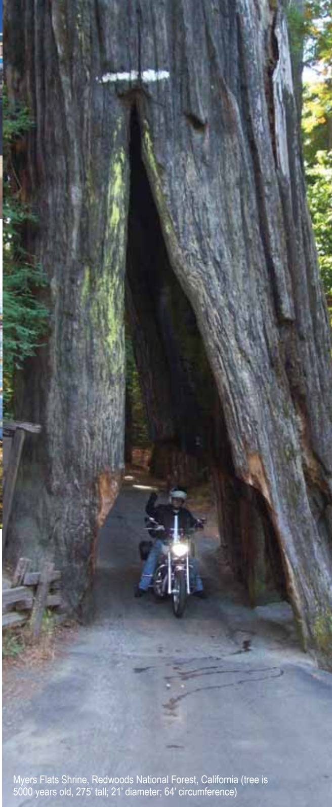
Myers Flats Shrine, Redwoods National Forest, California (tree is 5000 years old, 275' tall; 21' diameter; 64' circumference)