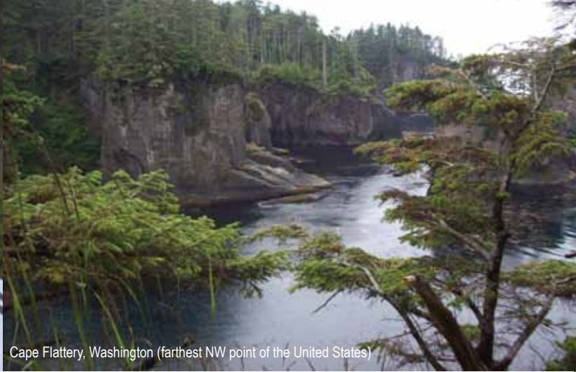
Cape Flattery, Washington (farthest NW point of the United States)