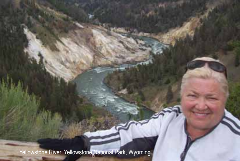
Yellowstone River, Yellowstone National Park, Wyoming