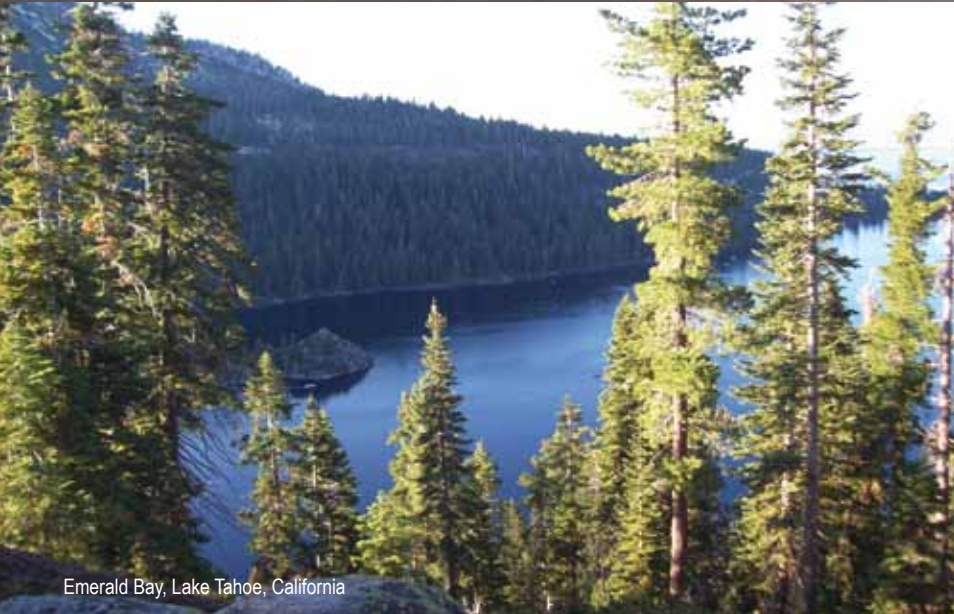
Emerald Bay, Lake Tahoe, California