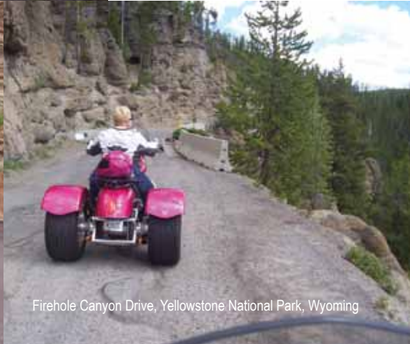
Firehole Canyon Drive, Yellowstone National Park, Wyoming