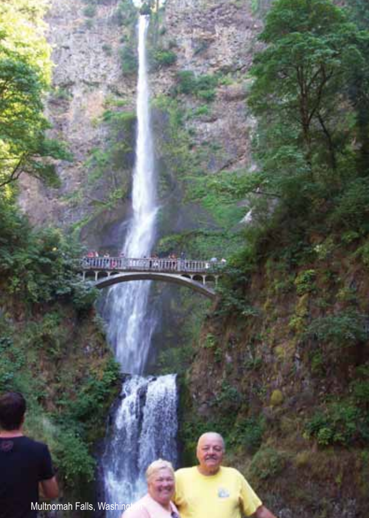
Multnomah Falls, Washington