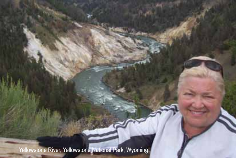
Yellowstone River, Yellowstone National Park, Wyoming