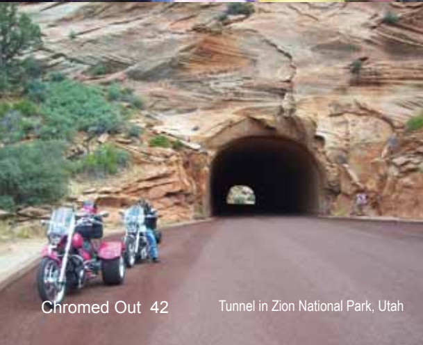
Chromed Out 42

As we rode we knew that God had us just where He wanted us to be, safe in His loving arms! Our trip gave us a renewed appreciation for the blessed America that God has bestowed upon each of us. He allowed us to experience so many wonderful places and people beyond our wildest dreams. He brought us so many different challenges and so many associated solutions that we are simply in awe of His love and power. Along this trip we developed a greater appreciation for: God and His creations; this country of freedoms and the many people who have fought, sacrificed and paid the price for our freedoms; the explorers and pioneers who braved the unknown to discover a new world; the brave people that developed the infrastructure we take for granted; and the friends and family that took a virtual journey with us.