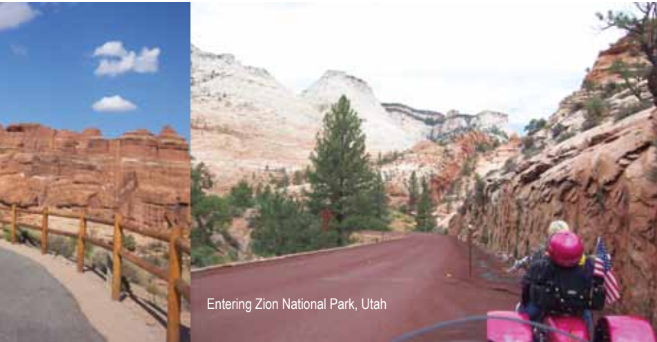
Entering Zion National Park, Utah