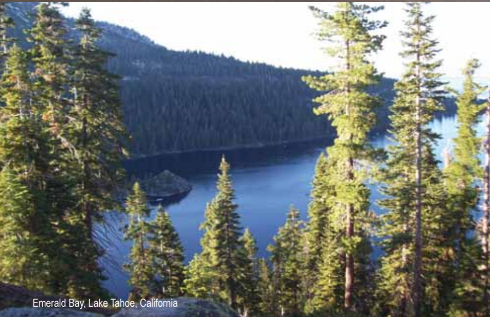
Emerald Bay, Lake Tahoe, California