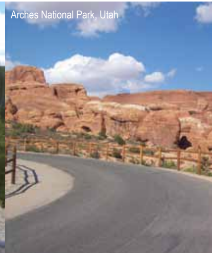
Arches National Park, Utah