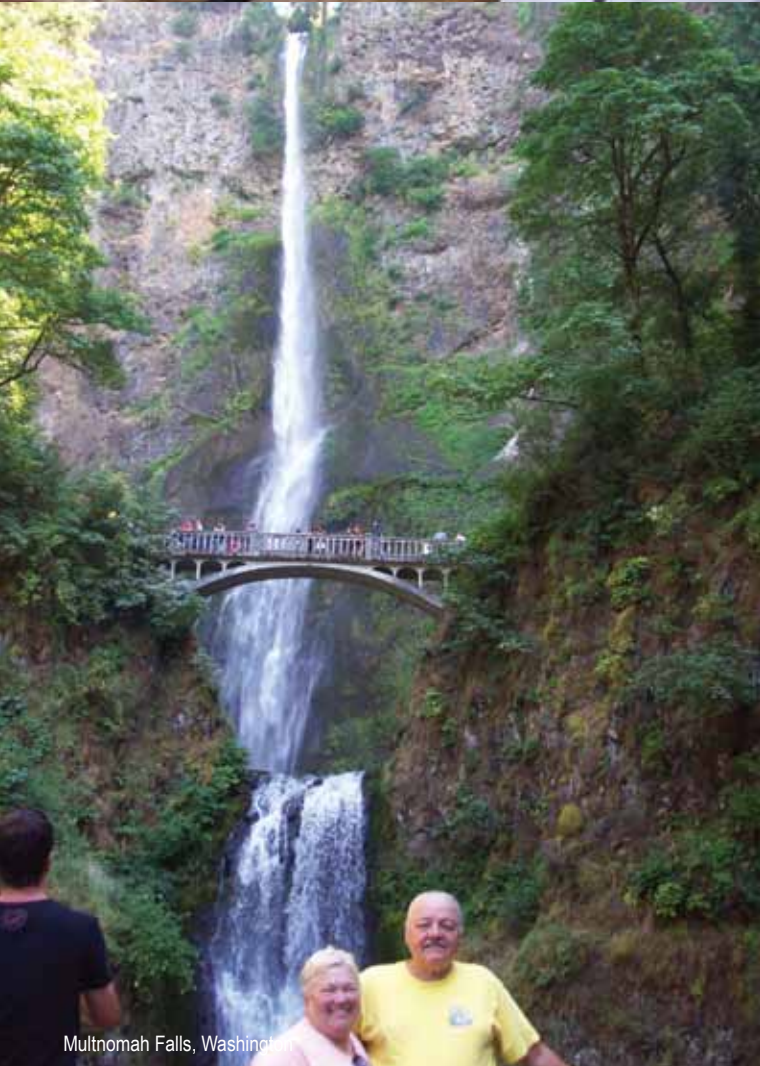
Multnomah Falls, Washington