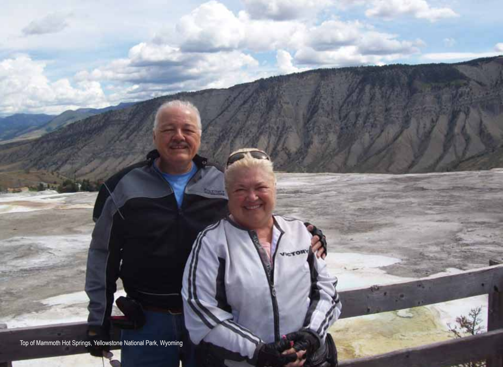
Top of Mammoth Hot Springs, Yellowstone National Park, Wyoming