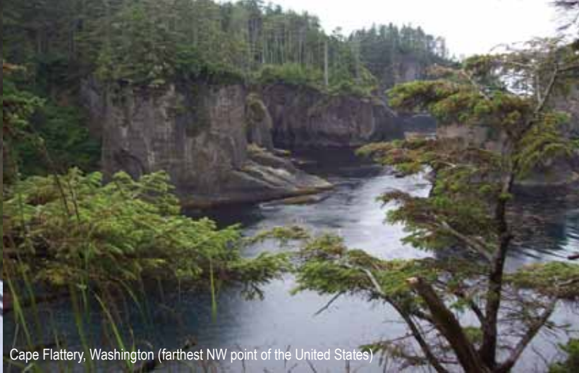
Cape Flattery, Washington (farthest NW point of the United States)