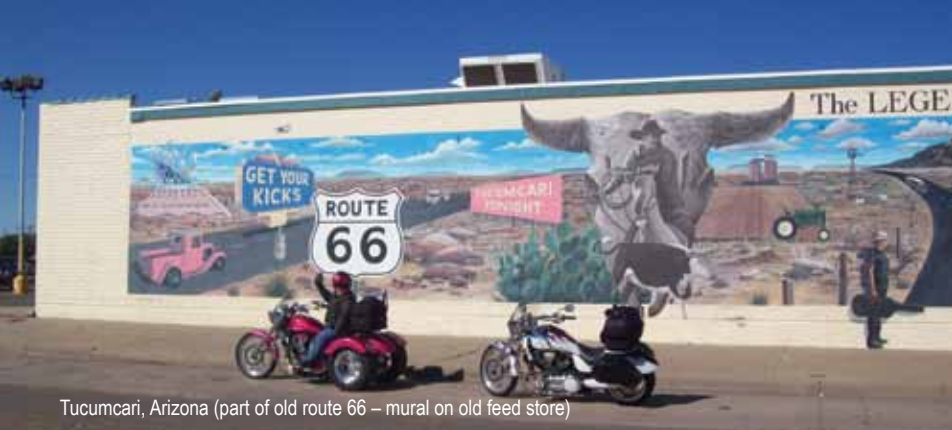
Tucumcari, Arizona (part of old route 66 – mural on old feed store)