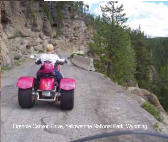
Firehole Canyon Drive, Yellowstone National Park, Wyoming