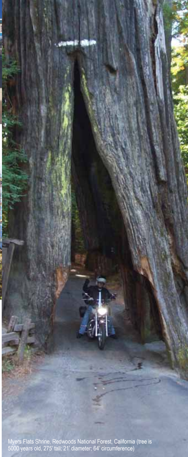
Myers Flats Shrine, Redwoods National Forest, California (tree is 5000 years old, 275' tall; 21' diameter; 64' circumference)